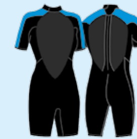
SPRING # 821