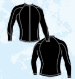
JACKET # 118 Front Zip