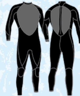
Full # 133