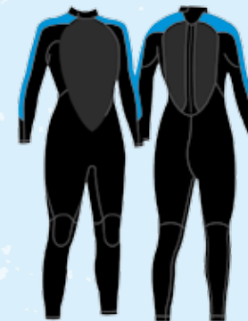
Full # 833