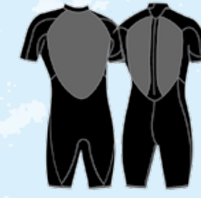
SPRING # 121