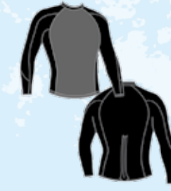
JACKET # 117 Back Zip