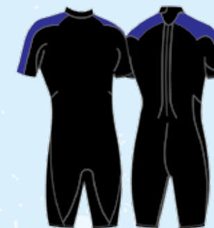
SPRING # 621