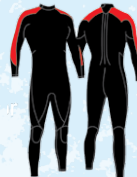
Full # 633